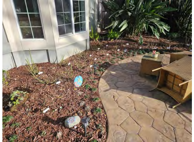
Perfectly Pruned Rose Garden-Check out what it looks like with BLOOMS!

Workshop will include: Review of the Rose Show Schedule, Choosing a rose show quality rose, Tips for transporting roses to the show, Prepping the rose, Staging the rose, and Creating the entry tag.