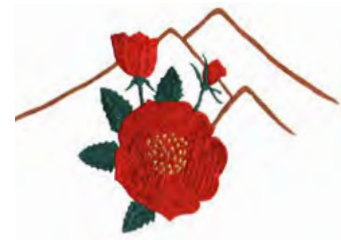
Sierra Foothills Rose Society